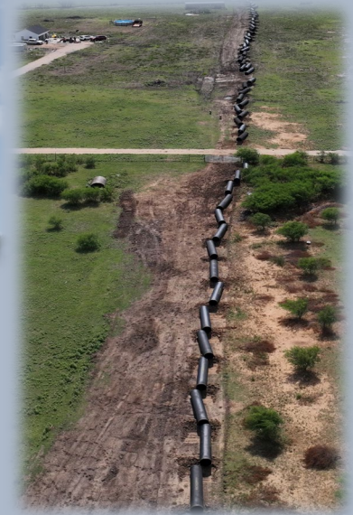
36-INCH TRANSMISSION LINE