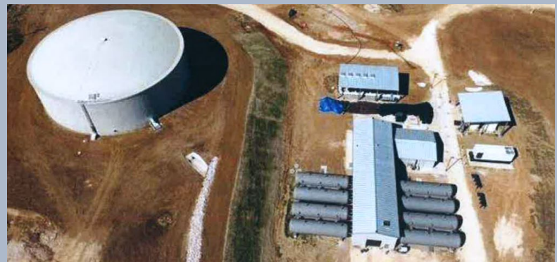
BLUE WATER TREATMENT PLANT

REPORTING WATER LEAKS AND EMERGENCIES 24 HOURS CALL (512) 856-2488