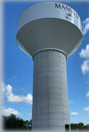
2 MGD ELEVATED STORAGE TANK GREGG-MANOR ROAD